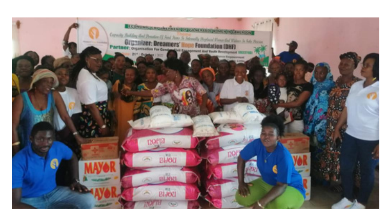
<u>Distribution of Food Items To 50+</u> Widows & IDPS