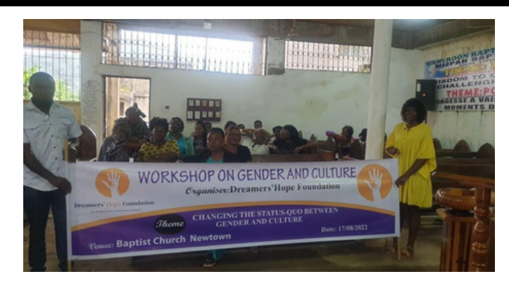
Workshop for Women On Cultural Norms & Its Effects On Gender