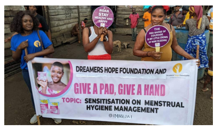
<u>Sensitization on Menstrual Hygiene</u> <u>Management (MHM) For Adolescent Young Girls</u>